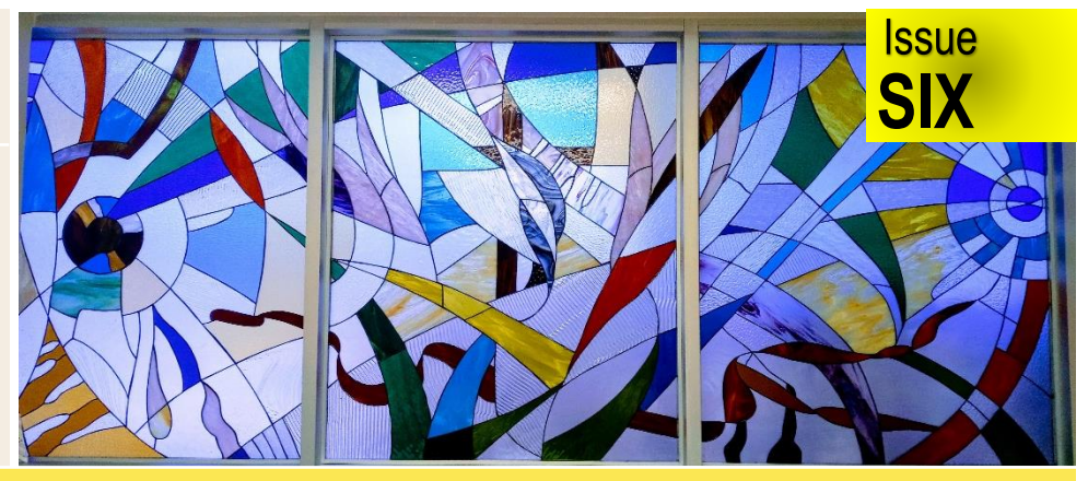
Psalm 33.18: "Behold, the eye of the LORD is upon them that fear him, upon them that hope in his mercy.